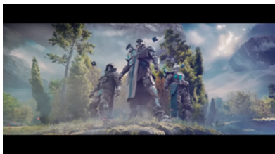
The Mill | Destiny 2

I did texture and lookdev work on some of the trees and the male elf's outfit. I also helped lay out a few trees and mushrooms in the background, and made the pale giant oyster mushroom. Referencing concept paintings and game screenshots was important, but looking at close ups of real plants helped a lot.