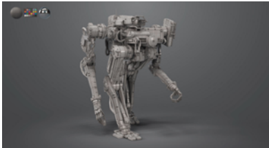
The Mill | Starfield

For this trailer I had fun building spaceship thrusters, robot limbs, and part of a crystal cave. I started from early concept images and some game assets, and built clean and high resolution subdividing parts based on implied details in low resolution normal maps and textures.