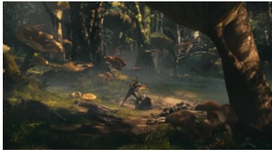
The Mill | Elder Scrolls Online