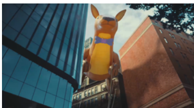
The Mill | Accenture

For this personal project I wanted to learn more about bird anatomy and creating feathers in Houdini. The male Hen Harrier stood out to me because of the unusual grey, and their dramatic flying. I studied photos/video from bird databases, and sculpted using a skull scan to help check head proportions.